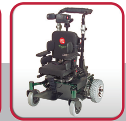
Flip Down Push Up Handle