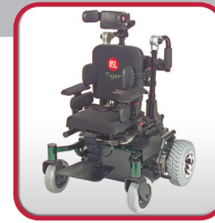
Power Tiger 10 x 10