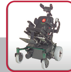
25 Degree Tilt