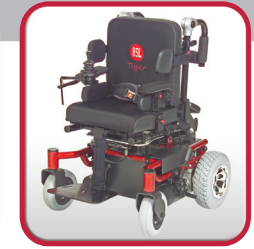
Power Tiger 12 x 12