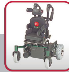
Power Tiger 6 x 6